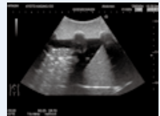
Pneumonia and pleural effusion