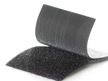
VELCRO ® ATTACHMENT