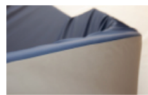
GRIP LOCK Base