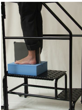
Standing Lateral Foot