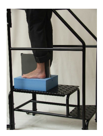
Standing Lateral Foot